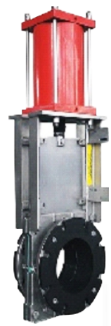
KNIFE GATE VALVES

Entresol products are designed for a wide range of industrial applications and services.